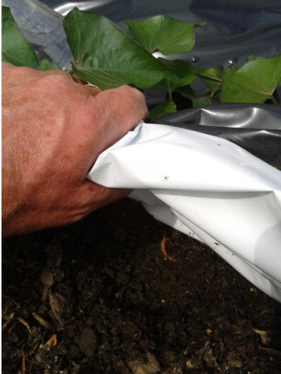
Sweet potatoes starting to spread out