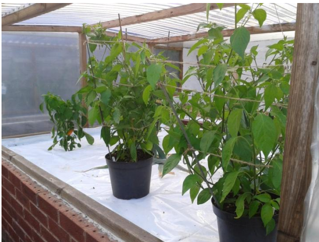
Lemon drop chillies staked ready for niece and nephew to pick up