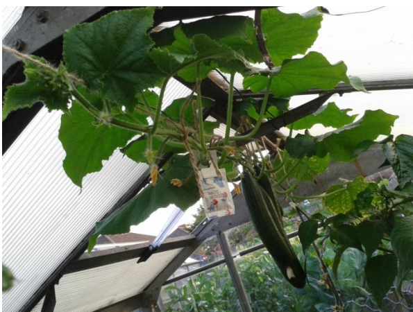
Cue now a third of the way across the greenhouse roof, you should get one cue at each leaf axle