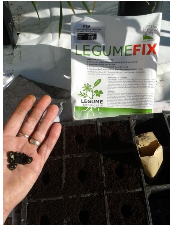
Peas having a legume fix (rhizobium inoculant) before sowing