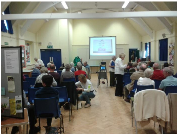
Another talk during the week at Wolverhampton Gardening Club - biggest screen I've ever seen!