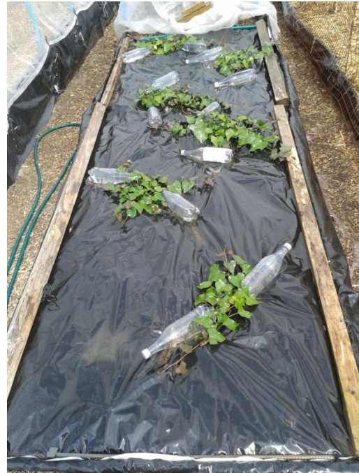
Checking under the plastic of the sweet spuds, the tubers are forming