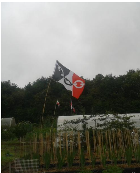
It's black country day today! This is the black country flag flying on my plot. The 3 colours: ( black) from furnaces giving out smoke and grime during the day, (red) from the furnaces glowing at night and the central white represents the glass cone, a symbol of the glass making heritage since 1790. The chains showing a typical product manufactured in the area. The black country as an expression dates back to 1840 and got its name from the black soot from the heavy industries that covered the area.