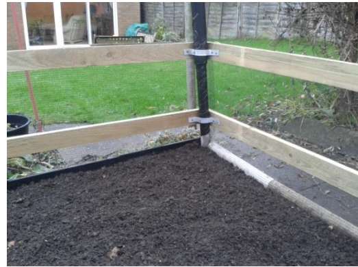
Netting goes inside tucked in the bed!!