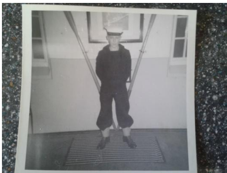
Me at 15 (HMS Ganges)

All our kit had to be embroidered with your name