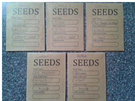
Chillies from my mate arrived