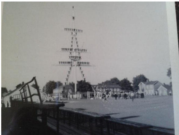
The famous mast we all had to climb!

Mess deck, floors were scrubbed with a hand brush!