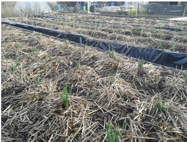
Outdoor onions, garlic and shallots doing alright