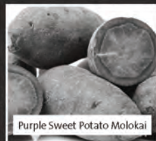
Purple Sweet Potato Molokai